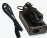
AC Power Supply (Catalog Number BA-501/BA-502) and Cable (Catalog Number varies by country)