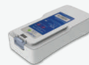
Extended Battery (Catalog Number BA-516)