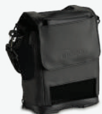
Carry Bag (Catalog Number CA-500)